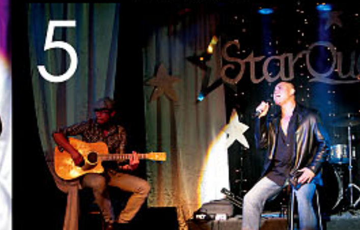
Cavan T Band

Check out some photos from Star-Quest 2010!