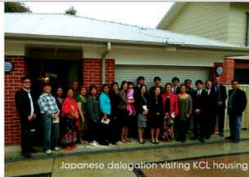
Japanese delegation visiting KCL housing

Well, there you go ... 2011. Where 'surprise' is the catchcry.