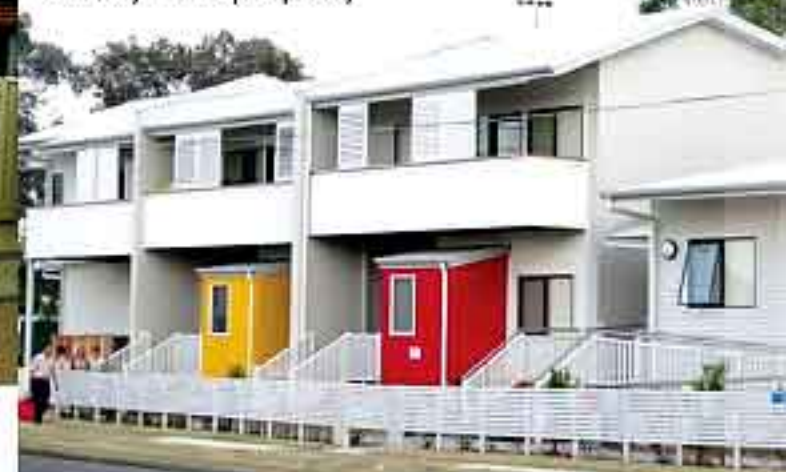
Canley Vale property