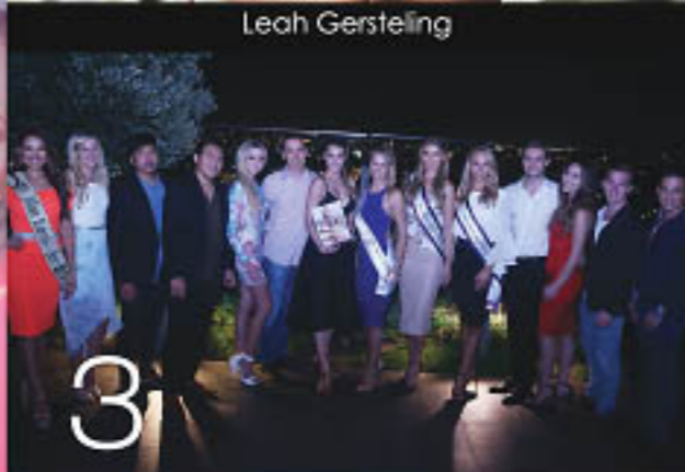
3 Aussie Elite models