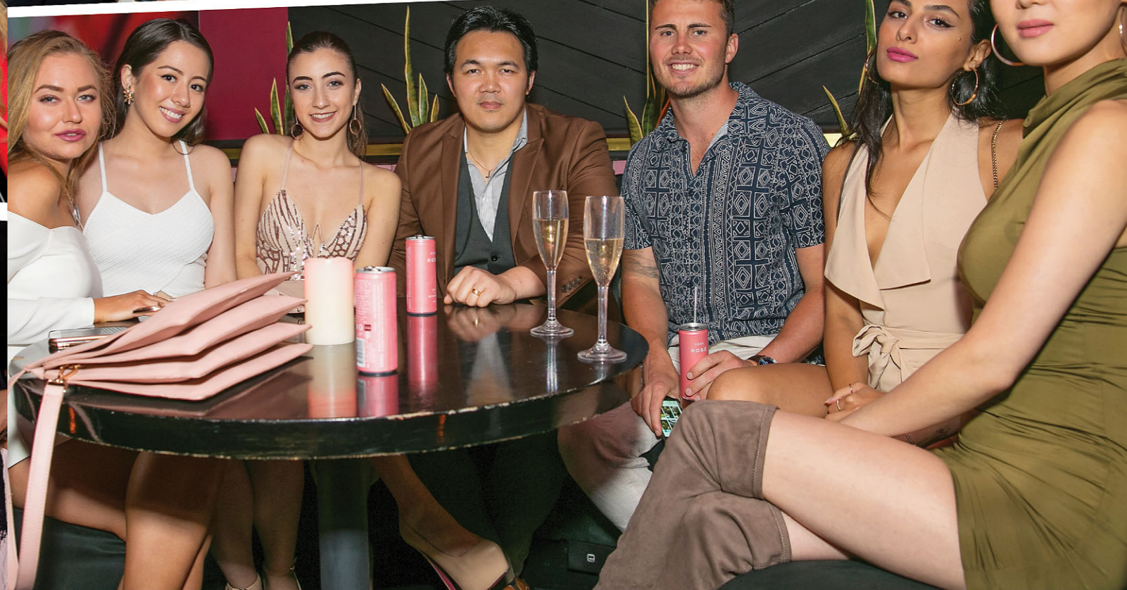
Maxim Australia's Hot 100 party at Flamingo Lounge, Sydney