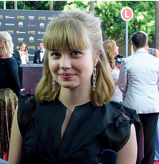
AACTA Awards 2017: Check Out All The Glitz And Glamour On The Red Carpet