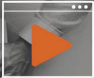
• Video Viral