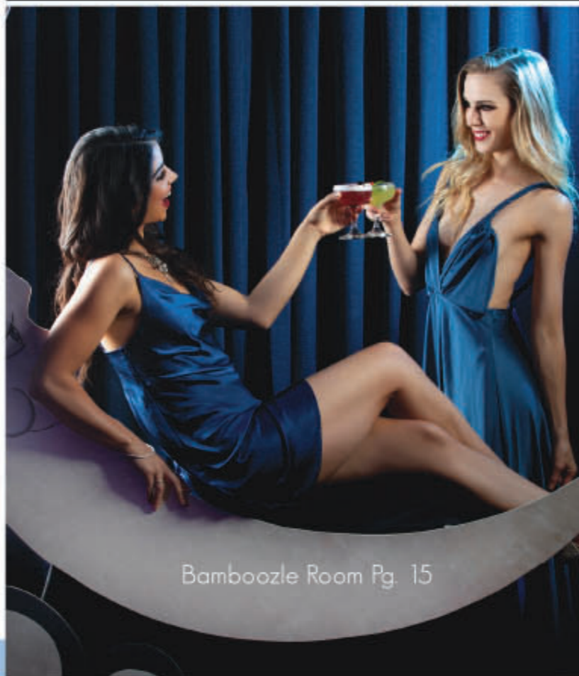
Bamboozle Room Pg. 15

All rights reserved. No articles or images may be reproduced in any manner whatsoever without written permission from the publisher.