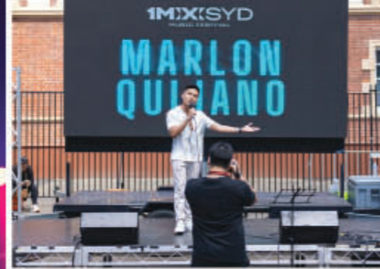
The inaugural 1MX Music Festival in Sydney was a testament to the power of music in transcending borders and celebrating diversity.