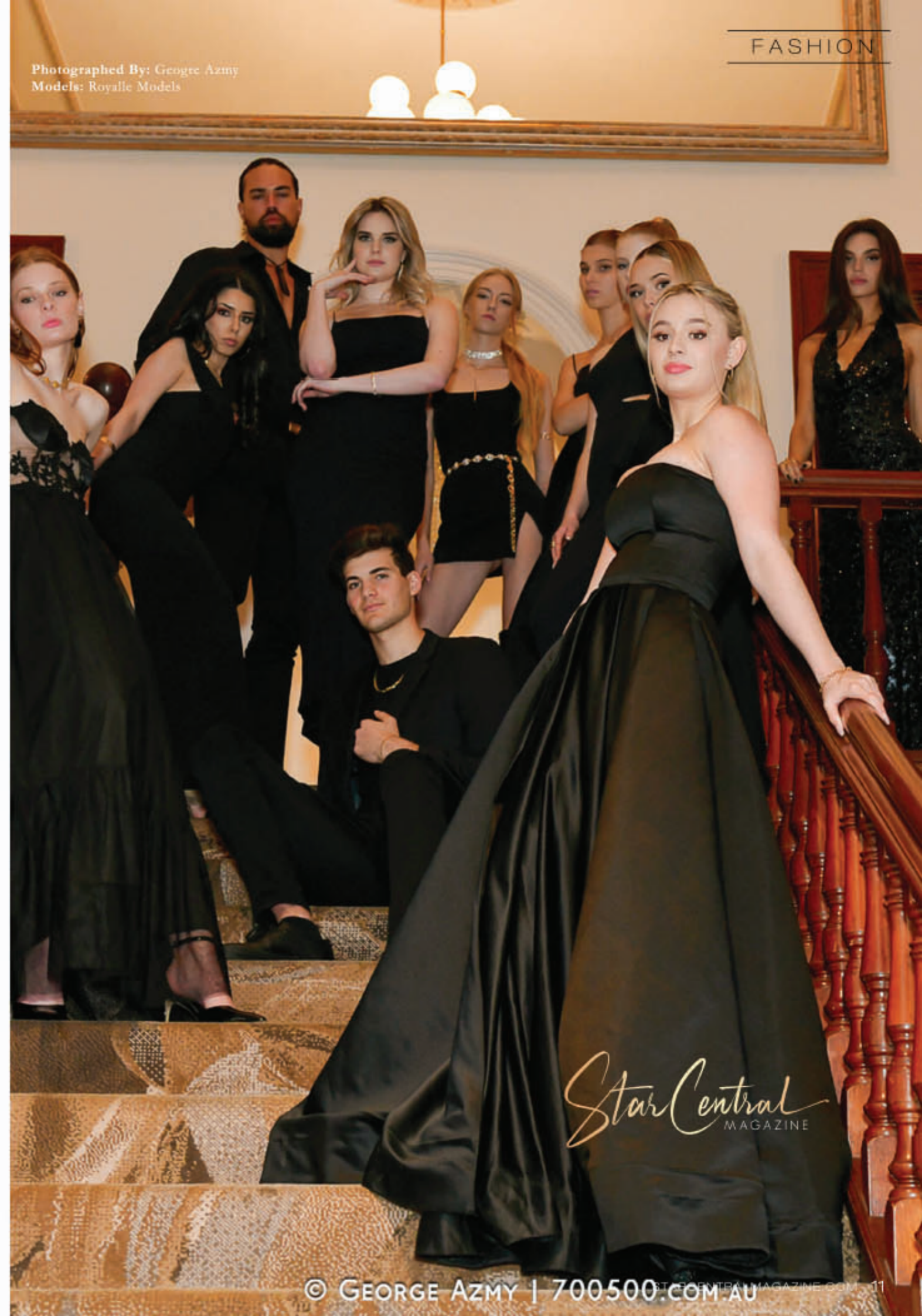
Models: Royale Models