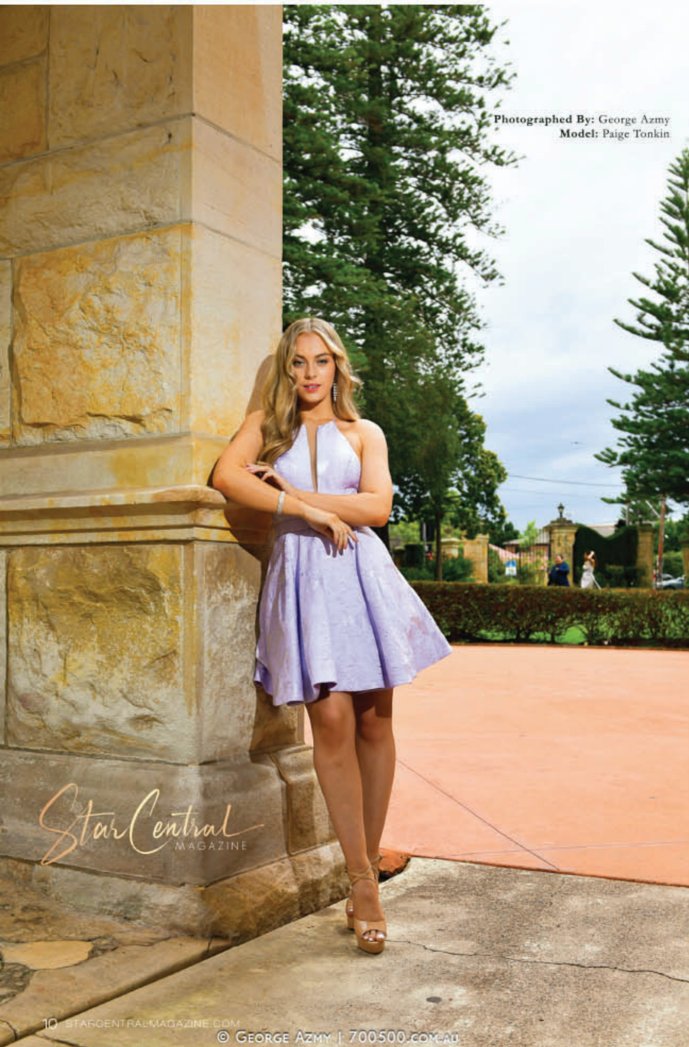
Model: Paige Tonkin