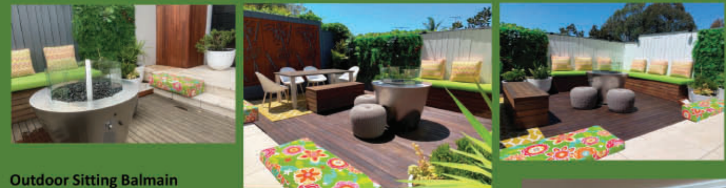
Outdoor Sitting Balmain