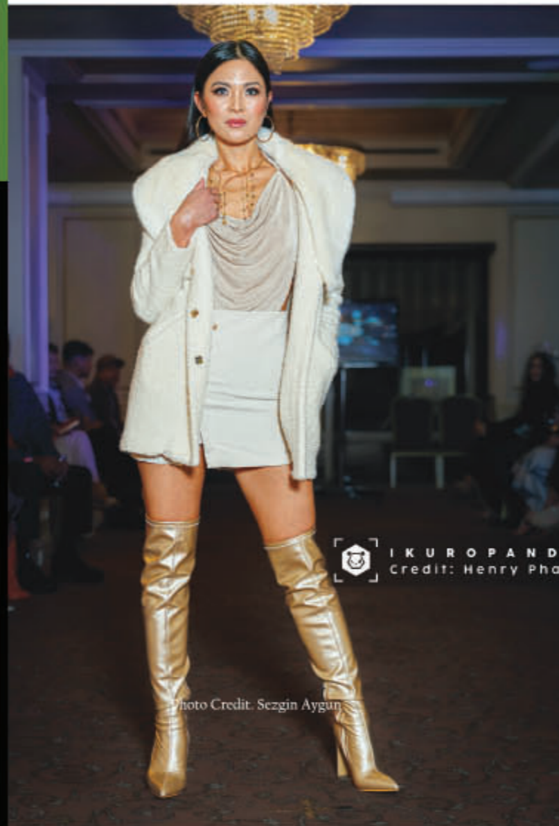
IKUROPAND