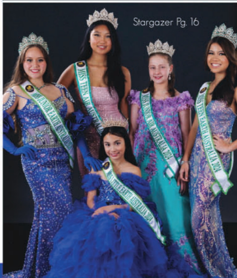
Stargazer Pg. 16

All rights reserved. No articles or images may be reproduced in any manner whatsoever without written permission from the publisher.