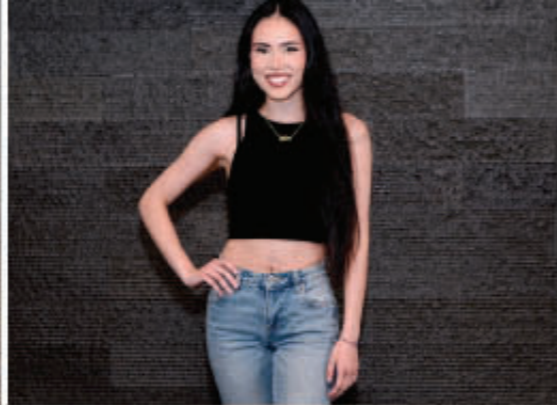
Check out some of the highlights from the rehearsal for the Cover ModelQuest finalists as they prepare to shine at the Grand Multicultural Entertainment Festival 2024!