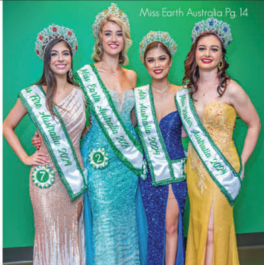
Miss Earth Australia Pg 14